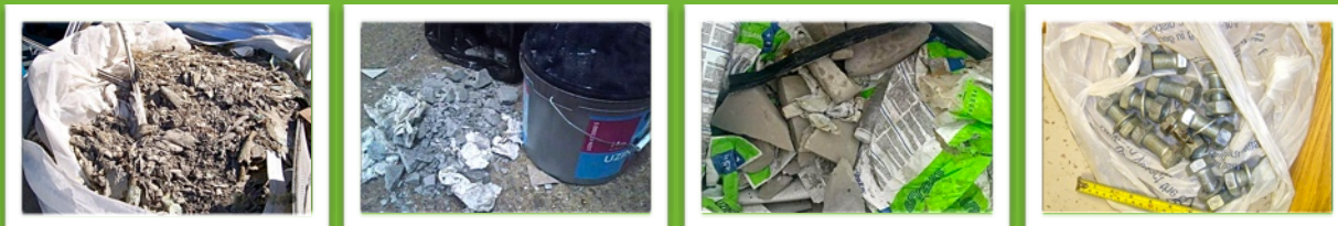
Photographs of various contaminants found in Recofloor bins and bags.

If you are in any doubt as to whether you are collecting the correct materials, we have a dedicated waste consultant who can advise on this issue. Please contact the team for further details.